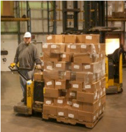
Distribution & Replenishment Centers